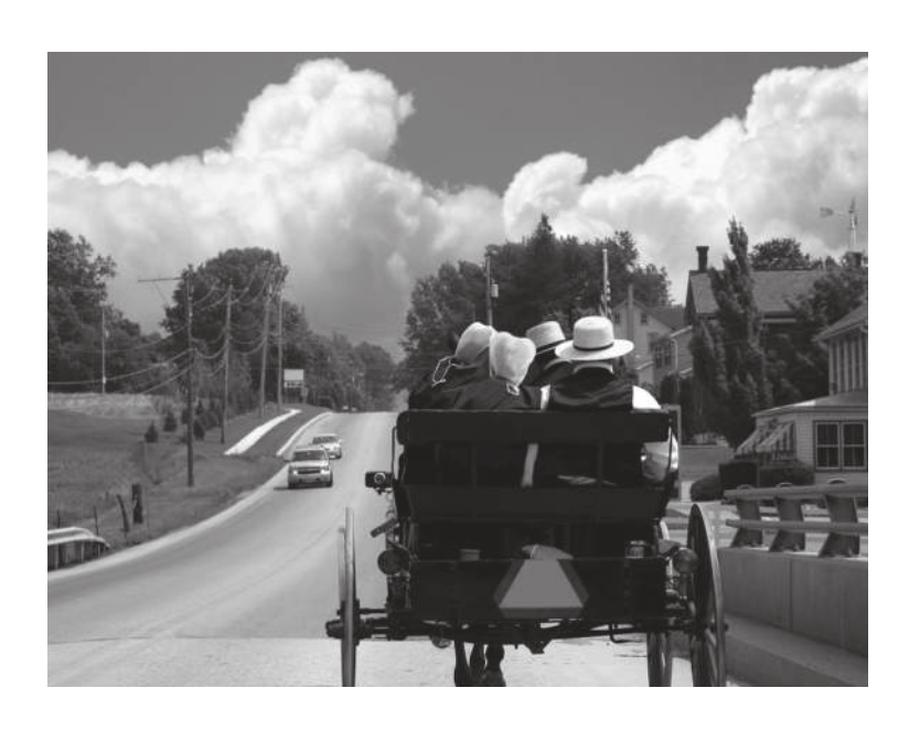
Image of the Amish travelling in a courting buggy on a road in Pennsylvania

The Amish are a religious community in Pennsylvania, USA. Their strict religious beliefs mean they reject some features of modern lifestyles, like the motor car. Individuals who do not conform to the norms of the group can face ostracism by their community. The Amish have become a tourist attraction because their way of life is so different. There can be conflict between them and the tourists as their religion means they are not happy to be photographed.